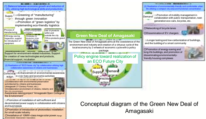
Conceptual diagram of the Green New Deal of Amagasaki

Through development of and support to environment-related industries with the aim of further stimulating environment-related demand contributing to environmental preservation and strengthening the capability to supply technology, products and services to meet demand, the Green New Deal of Amagasaki is aimed at creation of a virtuous cycle of supply and demand with focus on the environment, and coexistence of the environment with industry.