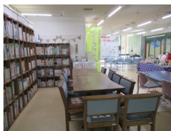
Space for activities and approx. 2,000 books relating to the environment

The activities are led by the Implementation Committee for NPO Amagasaki Open College of the Environment consisting of citizens, business operators, schools, and the city government.