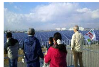
Eco educational tour